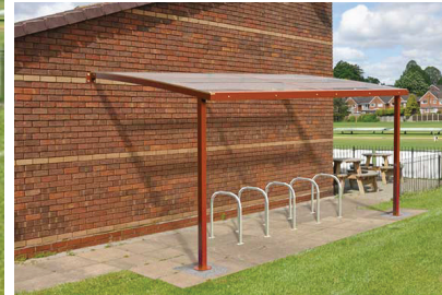
TUFF Orange Wall Mounted Cycle Shelter