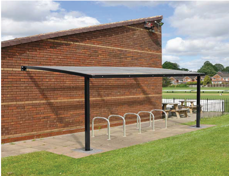
Black Wall Mounted Cycle Shelter - 5 Hoops