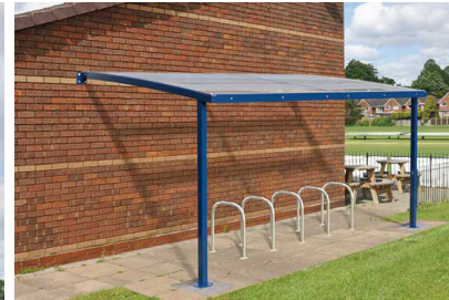
Blue Wall Mounted Cycle Shelter